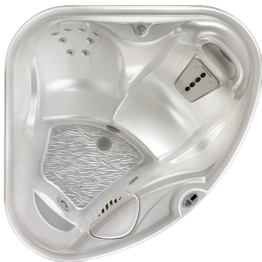
Shown with Pearl shell