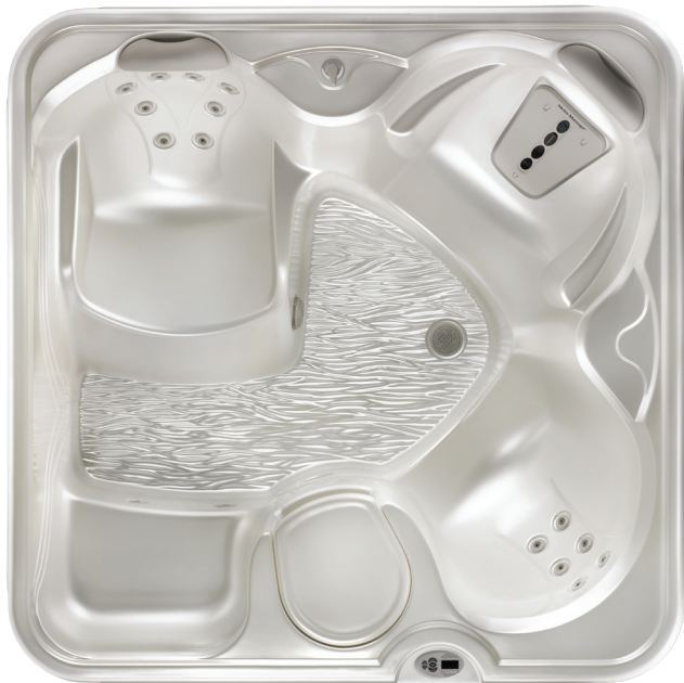
Shown with Pearl shell