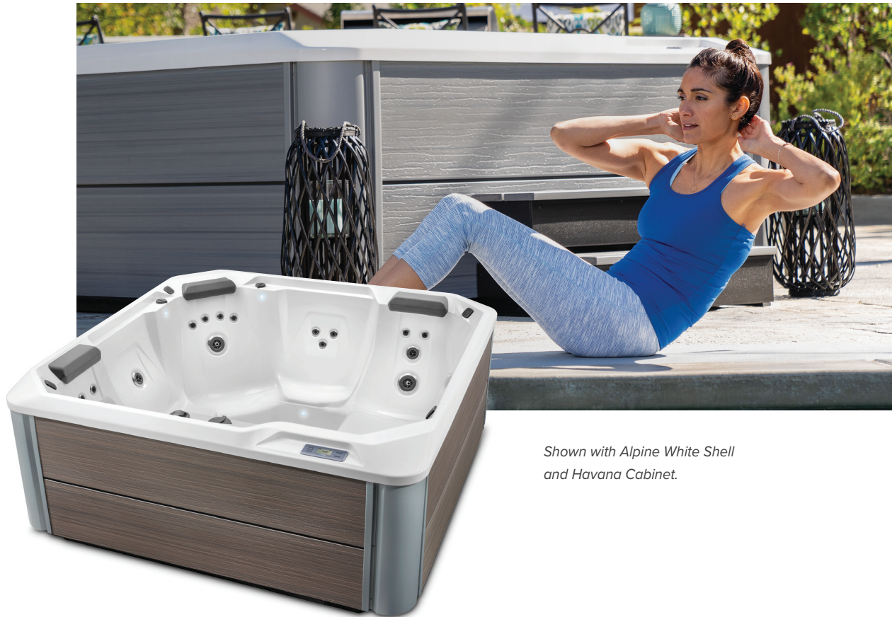
Shown with Alpine White Shell and Havana Cabinet.