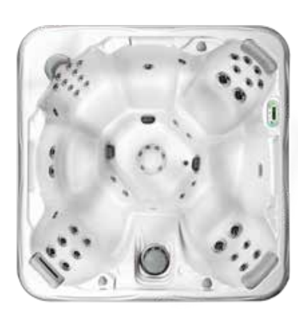
MARBLE, Silver Marble+