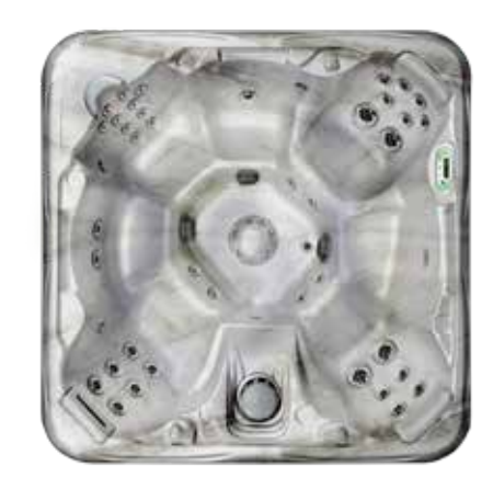
METALLIX**, Glacier Mountain+