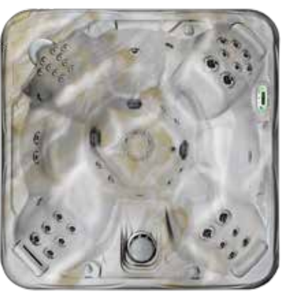
LUSTER SWIRL**, Smoky Mountains+