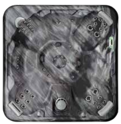
LUSTER SWIRL**, Storm Clouds