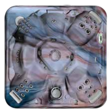
LUSTER SWIRL**, Tuscan Sun+