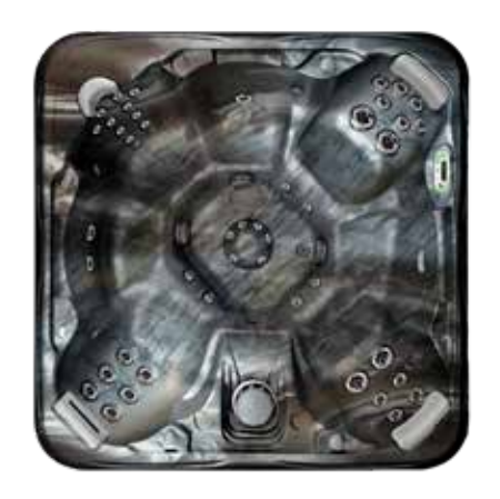
LUSTER SWIRL**, Midnight Canyon+

**Upgrade Colors | +965L Deluxe Available Color