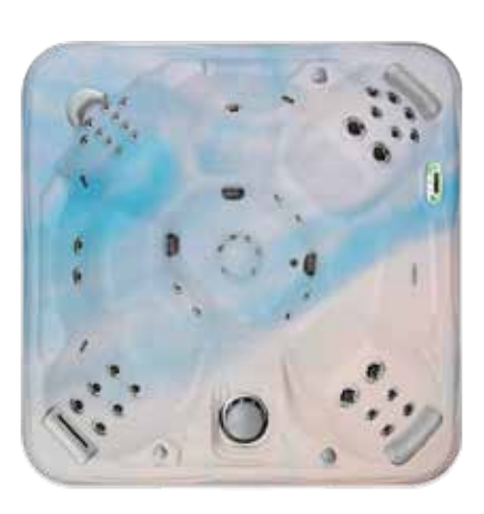
MARBLE, Wispy Blue