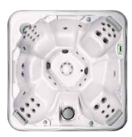
LUSTER**, White Pearl+