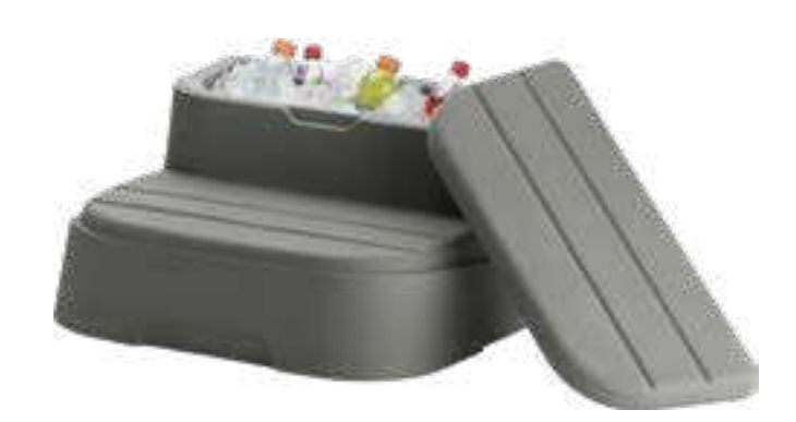
Shown in Taupe