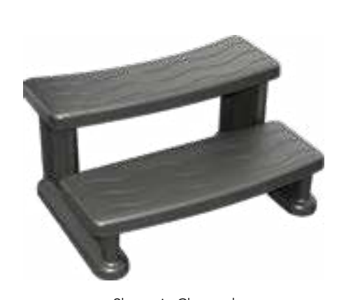
Shown in Charcoal