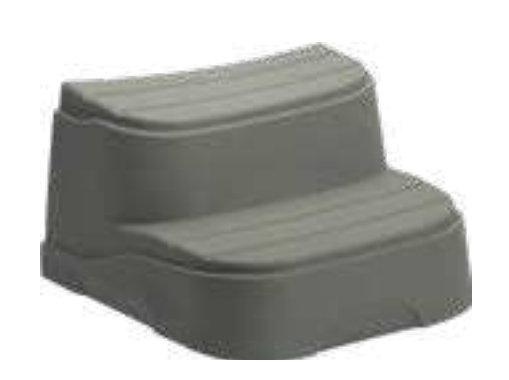
Shown in Taupe