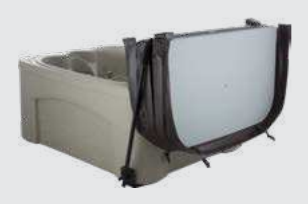
Entice® shown in Sand with Chestnut cover and lifter