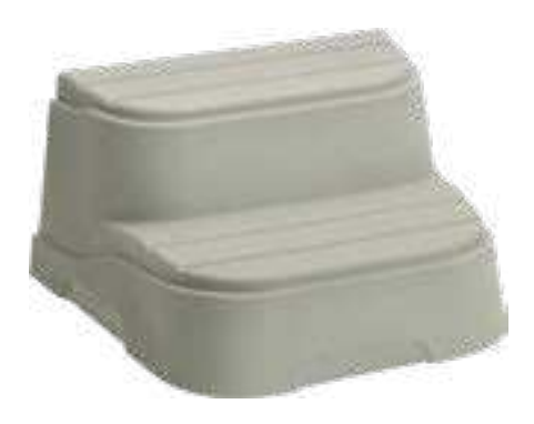
Shown in Sand