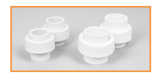
Union Connections (1-1/2" and 2" diameters)

E3T pool and spa heaters are compact, come standard with union connections, and are easy to install. They are the perfect solution for a new pool or spa, as well as to replace any existing pool or spa heater. Available in 5.5, 11, 18 and 27 kW.