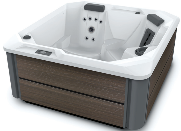
SX spa shown with Pearl shell and Havana cabinet.