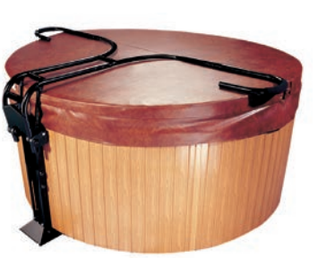
ADJUSTABLE MOUNTING BASE