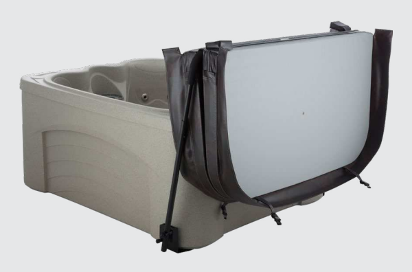
Entice shown in Sand with Espresso cover and lifter